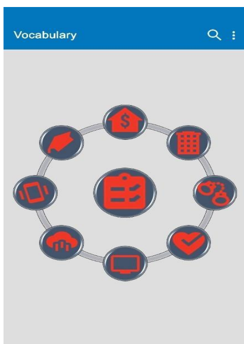
Figure 2. Home page of the vocabulary app

This page also provides a section up to the right, where users may search for specific information and customize the app.